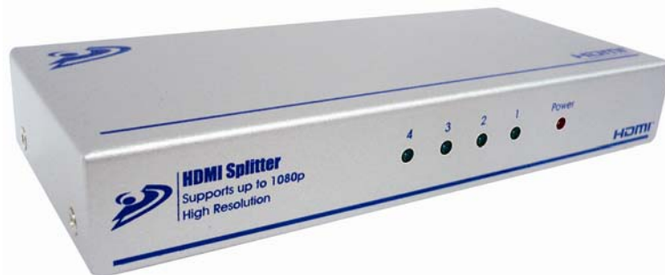
SP-00104-0B 4-Port HDMI Splitter