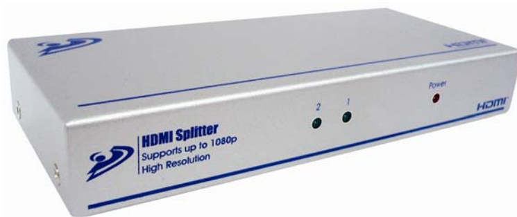
SP-00102-0B 2-Port HDMI Splitter