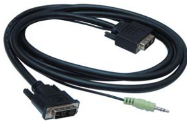
DVS-108AT DVI integrated AV Cable 1.8M