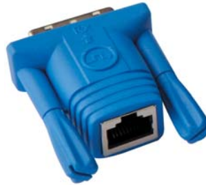
DVS-DR (Short-Range Receiver) RJ-45 to DVI-D Adapter