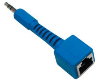
DVS-AR RJ-11 to stereo Adapter (Audio Transmitter and Receiver)