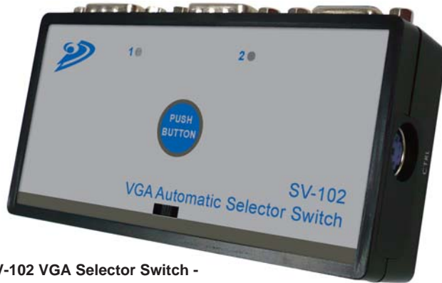
SV-102 VGA Selector Switch - Auto select two VGA sources to one monitor

Auto select two VGA sources to one monitor.