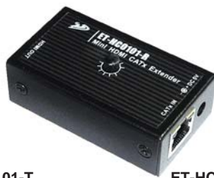
ET-HC0101-R Mini HDMI CAT-5 Receiver