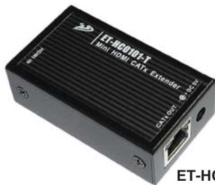
ET-HC0101-T Mini HDMI CAT-5 Transmitter

The HDMI Expander Family brings you endless possibility for digital signage, public display and large scale demonstration. Where crystal-clear digital video needs to be broadcasted, these expanders can bring your distribution system to the next level. The Mini HDMI Cat-X Extender pair is the perfect solution for simple point-to-point HDMI installation. With its compact innovative design, it greatly reduces installation spaces, conveniently extends HDMI signal without quality downgrade.