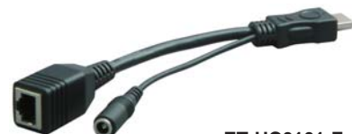
ET-HC0101-Z HDMI CAT-5 Receiver with Power (For SAMSUNG / LG LCD)